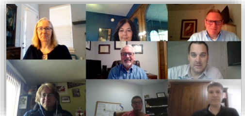
Teams Web Meetings - Our New Conference Room